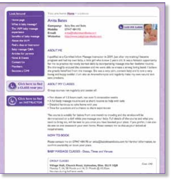
A sample personalised CIMI web page.